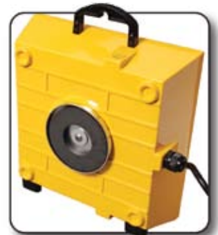
Powerful Hands Free Magnet

Cutting Edge—Solid State Lighting Solutions